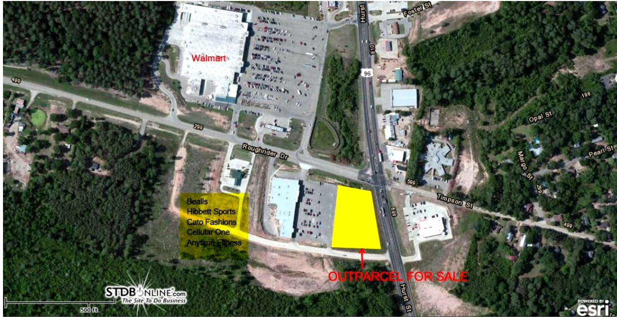
Located in front of 639—677 Hurst Street Center, TX