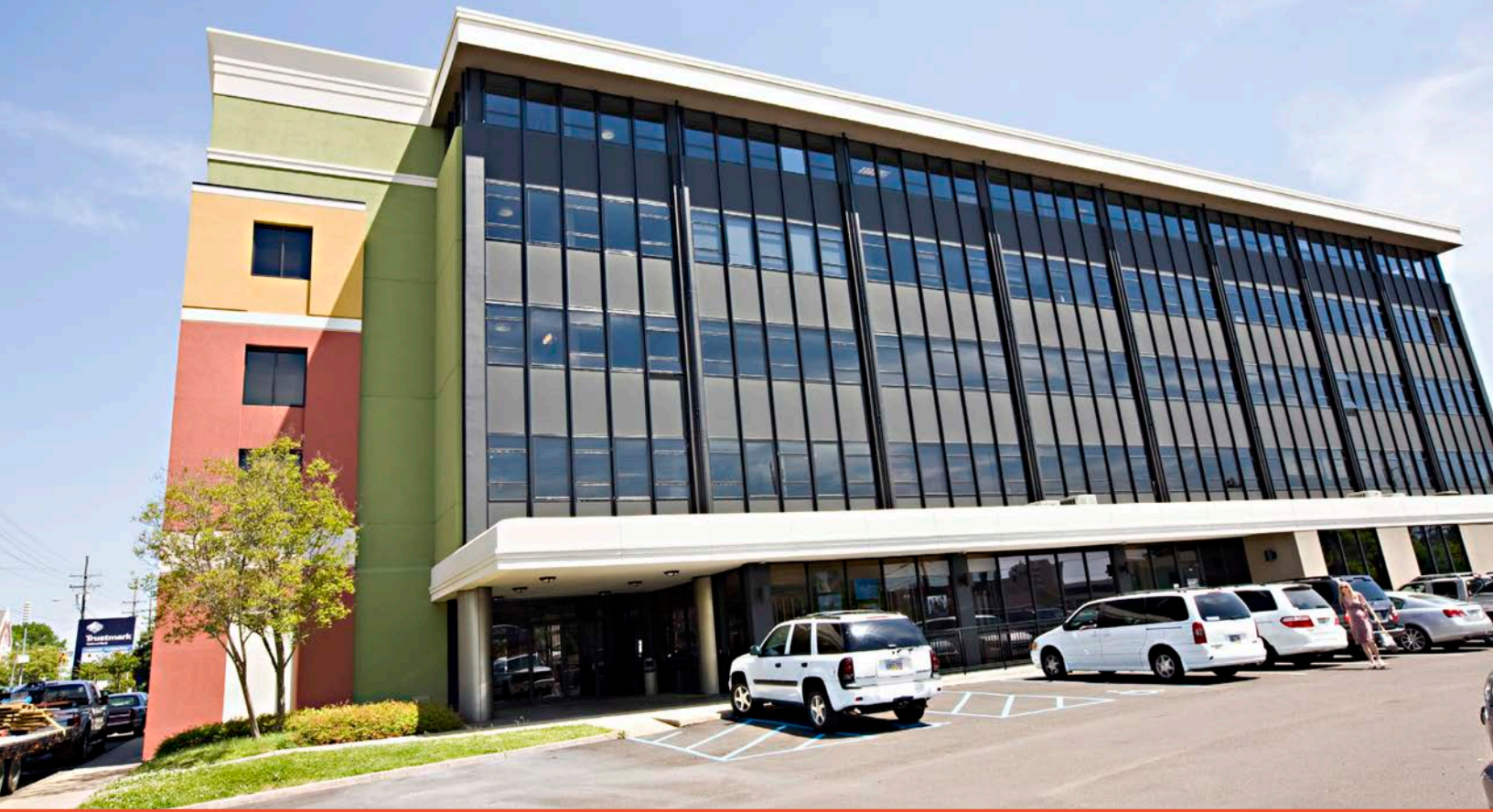
3000 FONDREN 3000 Old Canton Road Jackson, MS